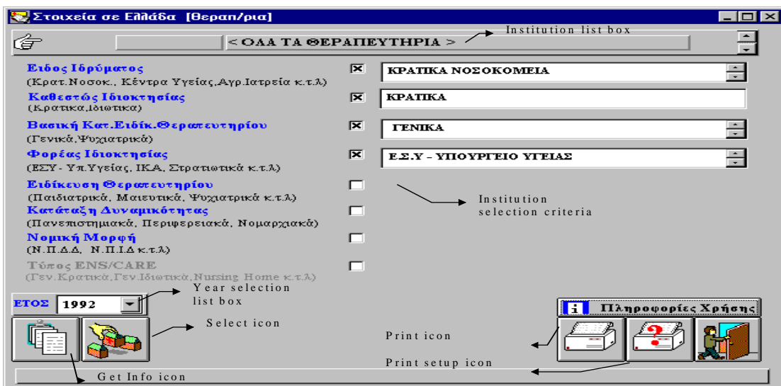
Figure 2(b) Query screen for selecting the type of institution within a specified geographical area.