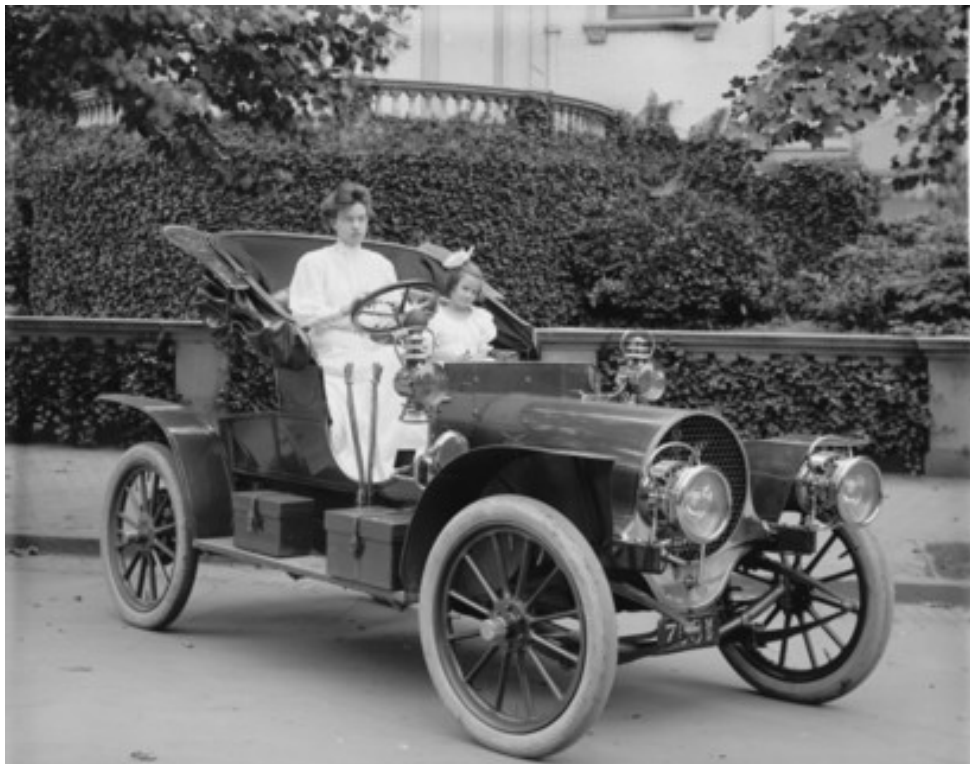
Figure 1: 1907 Franklin Model D roadster.

Figures should be centered, and their captions should be placed below them.